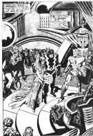
The spectacular wedding of Crystal and Quicksilver from the pages of AVENGERS #100-101 (Marvel Comics photo op.)

Pietro did not attend Wanda and Victor's wedding in Comic Art